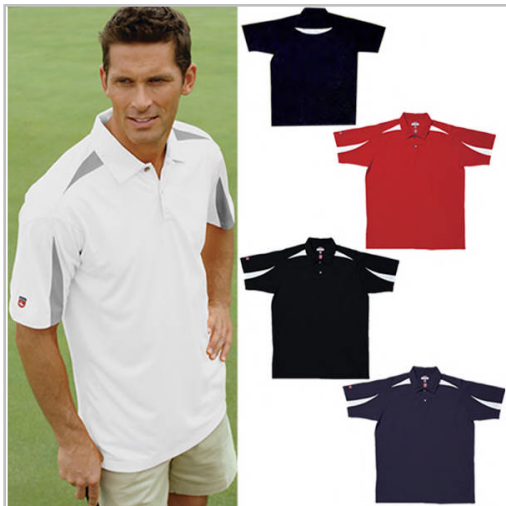
Product #: 122111

Quick - Men's micro polyester short sleeve shirt with 2- button placket.