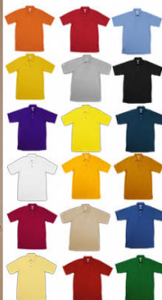
Product #: 120101

Excellence - Men's 100% micro polyester moisture management polo shirt.