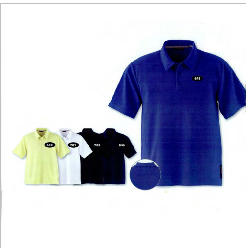
Product #: 88615

North End - Men's poly pique with mesh knit top.