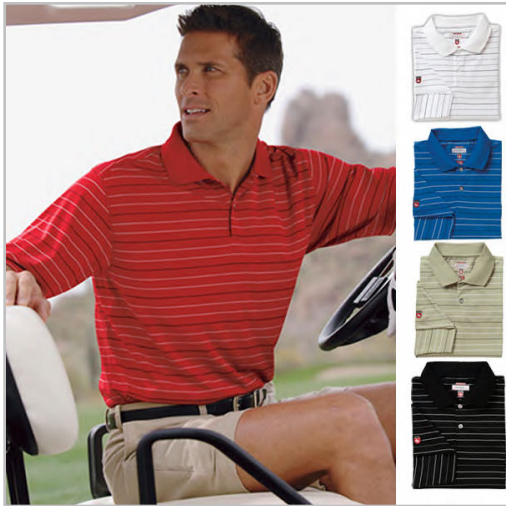
Product #: 122103

Accent - Micro polyester short sleeve shirt with 2- button placket.