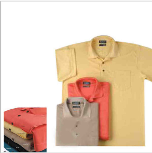
Product #: A406

TechniCool - Men's birdseye polo shirt, the ultimate in moisture-wicking performance.