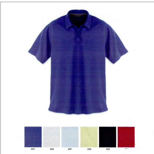
Product #: 88617

North End - Men's bamboo charcoal sport knit top.